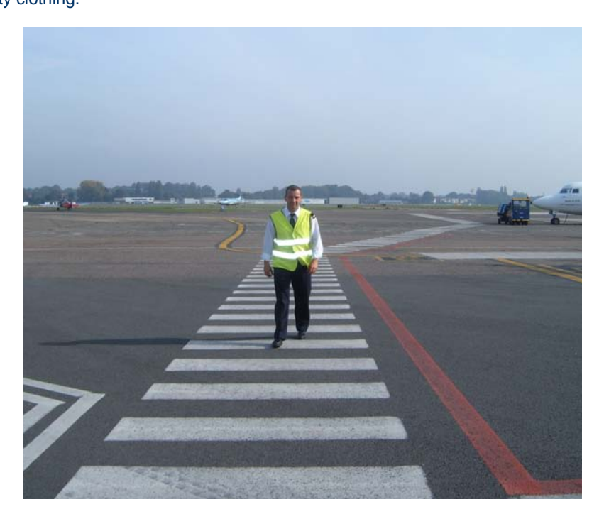
Traffic Regulations EBAW version 21 / 12 / 2009