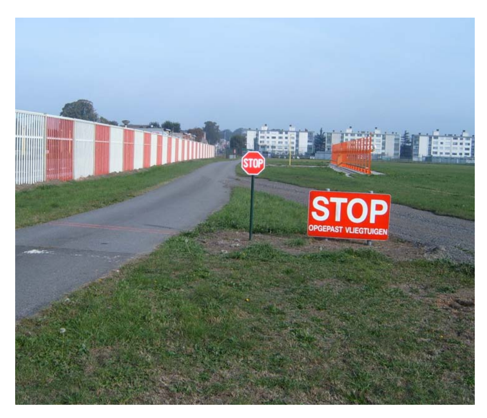
STOP at the intersection of sector V of the perimeter road and the approach of runway 11