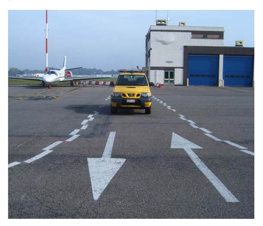
Compulsory use of the with white alternate blocks marked service drive to cross the apron

4.13.1. The service drives, marked by single solid white lines, must always be used, except if vehicles are unable to follow certain paths due to their size. In this case, a special procedure will be worked out between air-traffic control, airport inspection and the driver involved. Where a service drive crosses the apron, the service drive is marked in alternate blocks. Drivers must give absolute priority to moving aircraft when being on this part of the service drive.