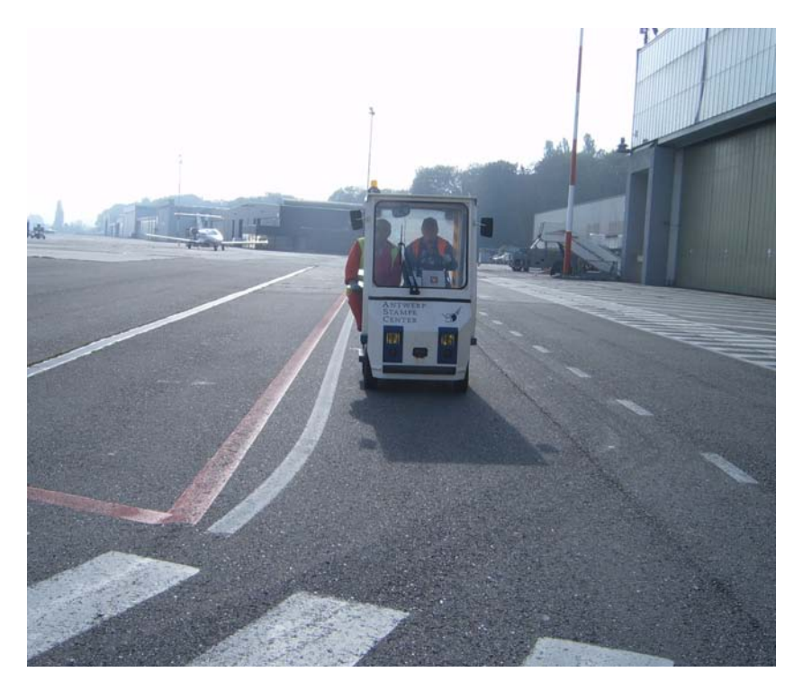
Compulsory use of the with white lines marked service drives for vehicles on the apron